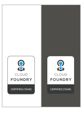
Minimum width 45px